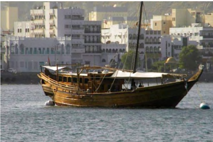
Traditional Dhow, Muscat

Oman has an interesting landscape, and it seems that the Earthshot Prize has helped to highlight the ancient rocks of Oman and how they can help to fix climate change.