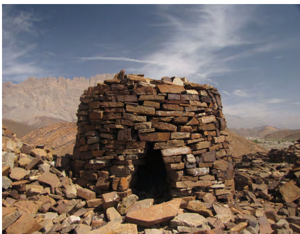
Prehistoric necropolis Al-Ayn in Ad Dhahirah