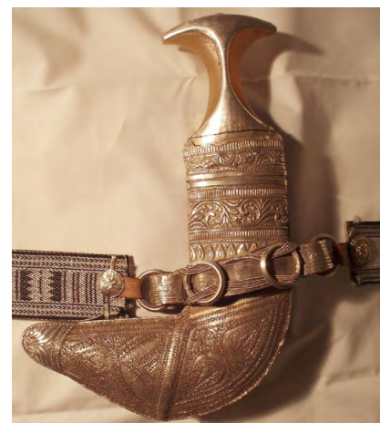
Traditional Khanjar dagger

More photographs of Oman: https://worldinfozone.com/gallery.php?country=Oman