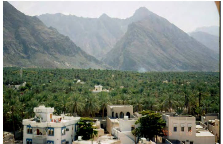
Palm tree farm